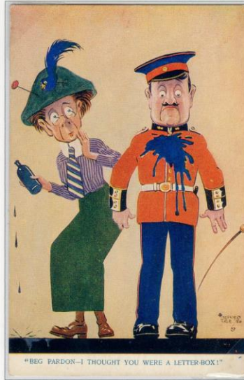
'London Opinion' postcard No.5033, artist: Alfred Leete.

1. SUFFRAGETTES ...threw bombs, acid and ink into pillar box apertures across the country from 1912-14, as part of the 'Votes for Women' campaign.