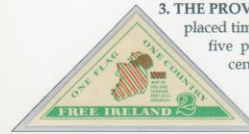
1971 'Patriotic Seal' propaganda label

3. THE PROVISIONAL IRA ... placed timed devices inside five pillar boxes in the centre of London in 1974. The blasts injured twenty people.