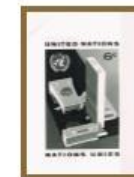
Photo-essay of the UN HQ completed in 1952. Design used for 1968 letter rate definitive issue.