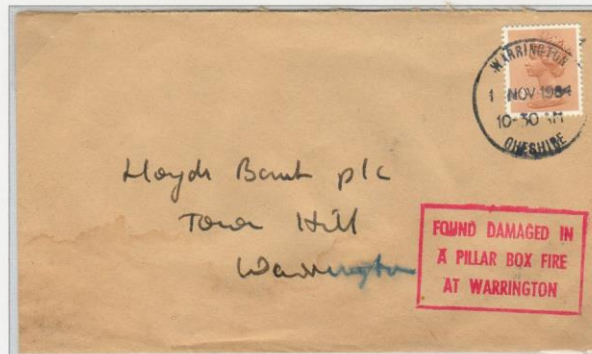
Cover salvaged from a pillar box fire in Warrington. There is also water damage, from where the fire was put out.

PLAN: Running through the entry, numbered section headings are in bold. Descriptions are in italics .