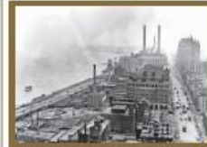
Photo of X-City Turtle Bay site looking southward prior to the demolition of the slaughterhouses and vacant tenement apartments and office buildings.

The UN Organization continued searching for a permanent site, and when developer William Zeckendorf heard that the UN's plans fell through he proposed using "X City" as the Permanent headquarters of the United Nations.