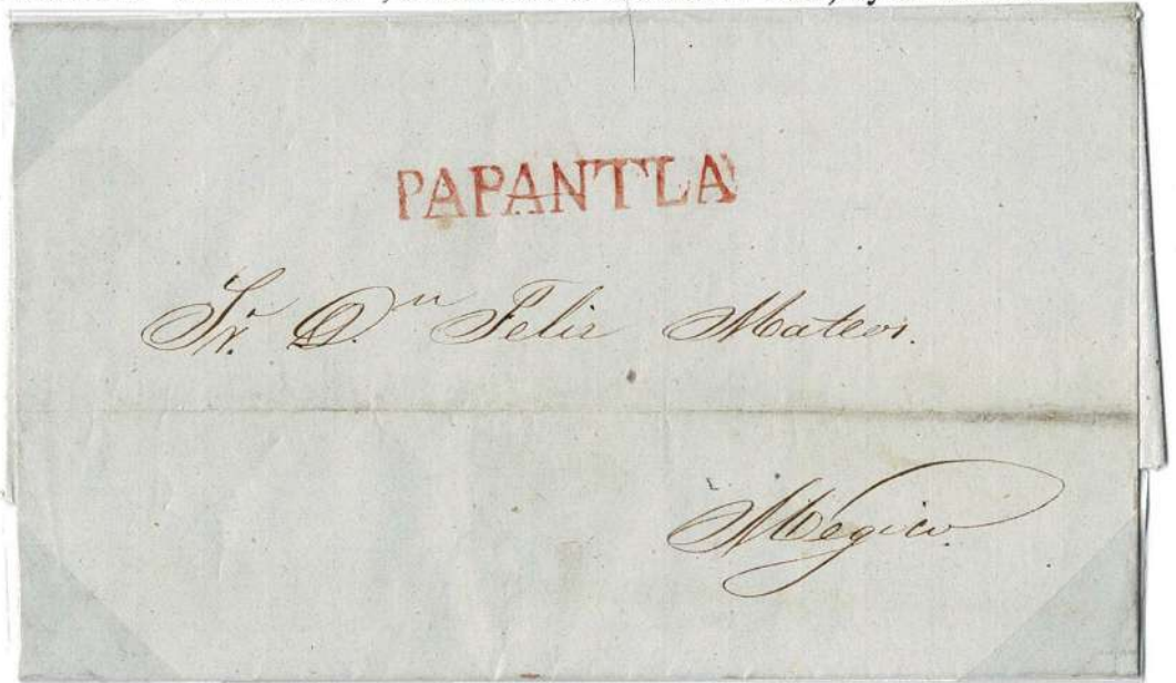
Entire of December 14 th 1854 from Papantla to Mexico City Straight line PAPANTLA in red