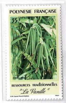
Flower of Vanilla planifolia : French Polynesia 1990 Traditional resources issue

It is thought that the Totonac were the earliest people to cultivate the vine for use as a cacao-beverage spice. It was called tlixochitl (which translates as “ black flower ”, a reference to the mature bean) by the Aztecs .