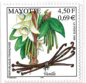
“ black flower ” The matured beans of Vanilla planifolia French Mayotte 1999