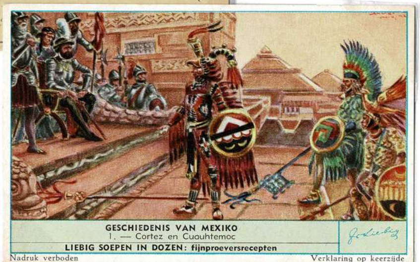
Leibig Trade Card: History of Mexico 1. Cortez meeting Cuauhtemoc, the last Aztec Emperor.