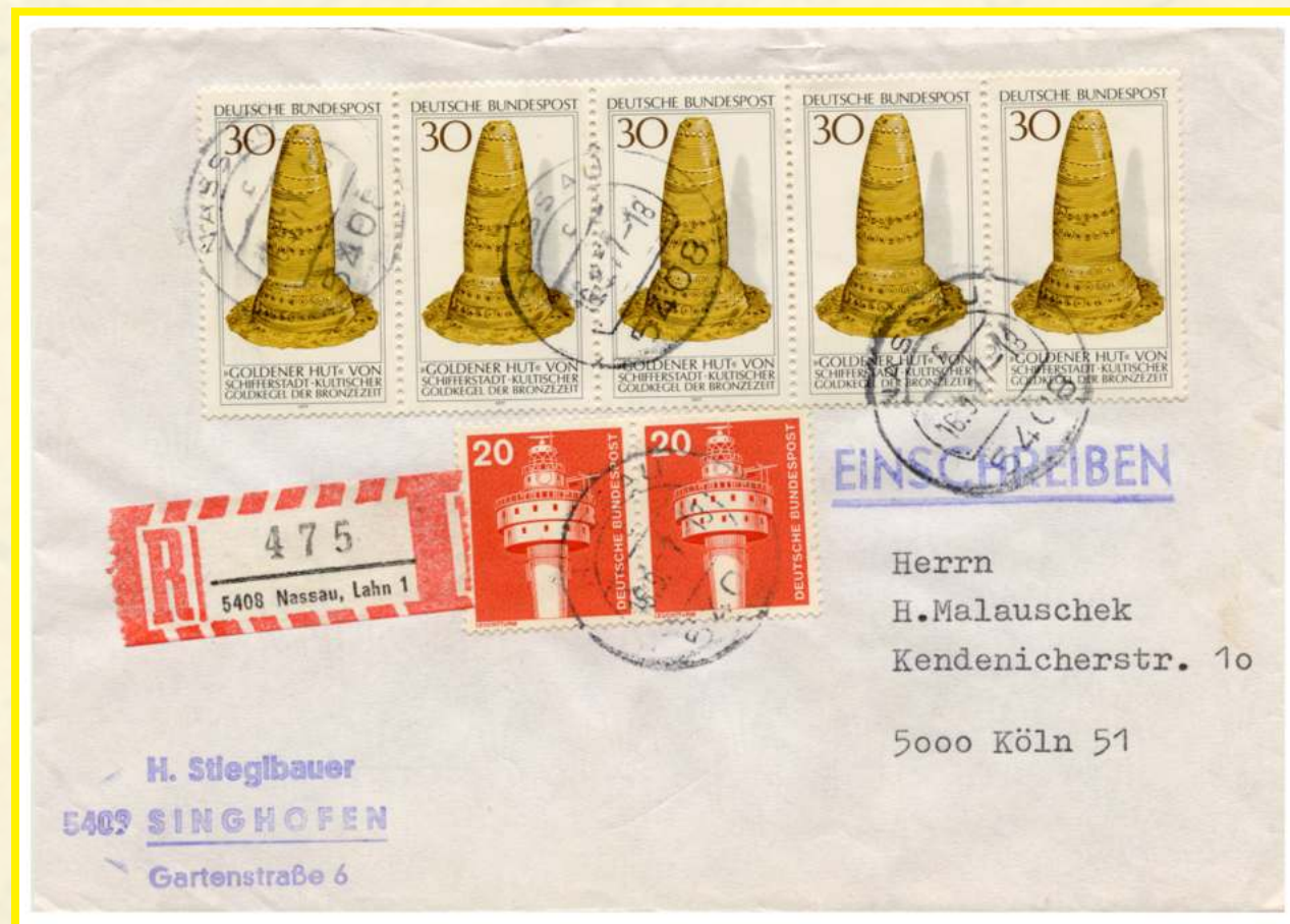
Nassau to Köln (Cologne), Germany, 16 March 1977 50 pfennig domestic letter rate plus 1.40 marks registry fee