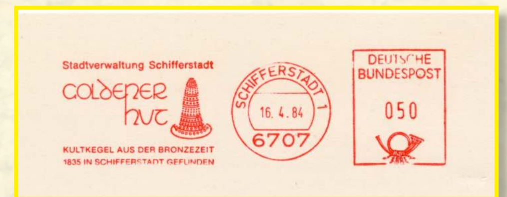
Postage meter machine cancel with illustration in slug area 16 April 1984, 50 pfennig (domestic single weight letter rate)

It is now displayed in Speyer Historical Museum.