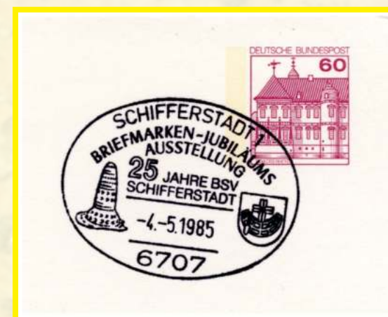
Commemorative hand cancel depicting the Golden Hat