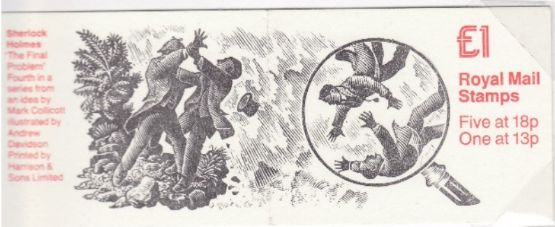
Stamp Booklet for "The Final Problem"

Conan Doyle, wishing to be recognised for his more serious works, was never happy that public affection for Sherlock Holmes detracted from these. As such in 1893 he wrote "The Final Problem" in which he killed off Sherlock Holmes and arch enemy, Moriarty, who together plunged over the Reichenbach Falls.