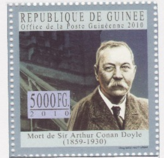
Stamps depicting Sir Arthur Conan Doyle

Conan Doyle, wishing to be recognised for his more serious works, was never happy that public affection for Sherlock Holmes detracted from these. As such in 1893 he wrote "The Final Problem" in which he killed off Sherlock Holmes and arch enemy, Moriarty, who together plunged over the Reichenbach Falls.