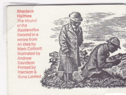
A selection of 'Hound' related items including USA postmark and a private mail label