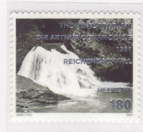
Swiss stamp depicting the actual Falls with book reference overprint