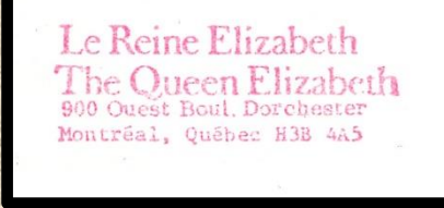
Meter stamp of "Queen Elizabeth Hotel"