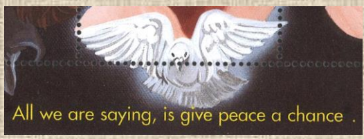
St. Vincent 1995 - Sheet margin with a line of text from "Give Peace a Chance"