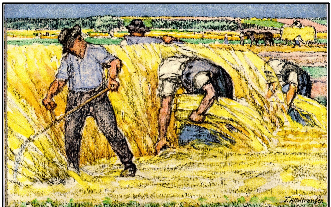
Switzerland 1920 - 7 1/2 cent inside postcard