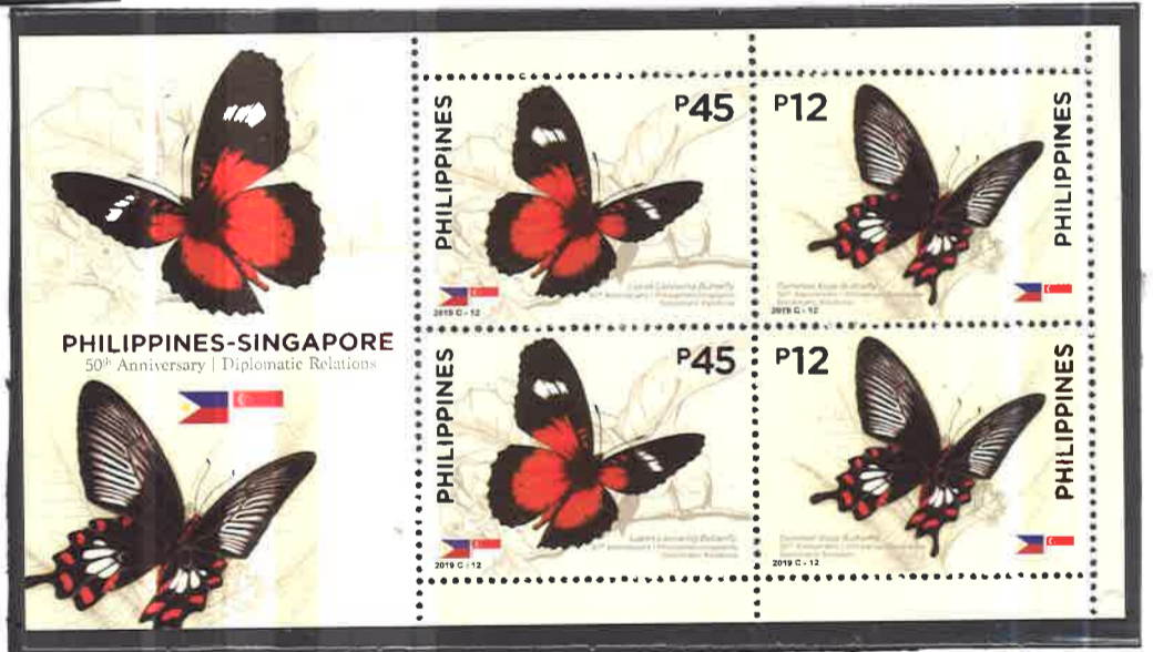
Philippines, 2019 Miniature sheet and two se-tenant stamps featuring Luzon Lacewing Butterfly, representing Philippines and Common Rose Butterfly, representing Singapore Joint stamp issue celebrating 50 th Anniversary of Diplomatic Relations between the two countries