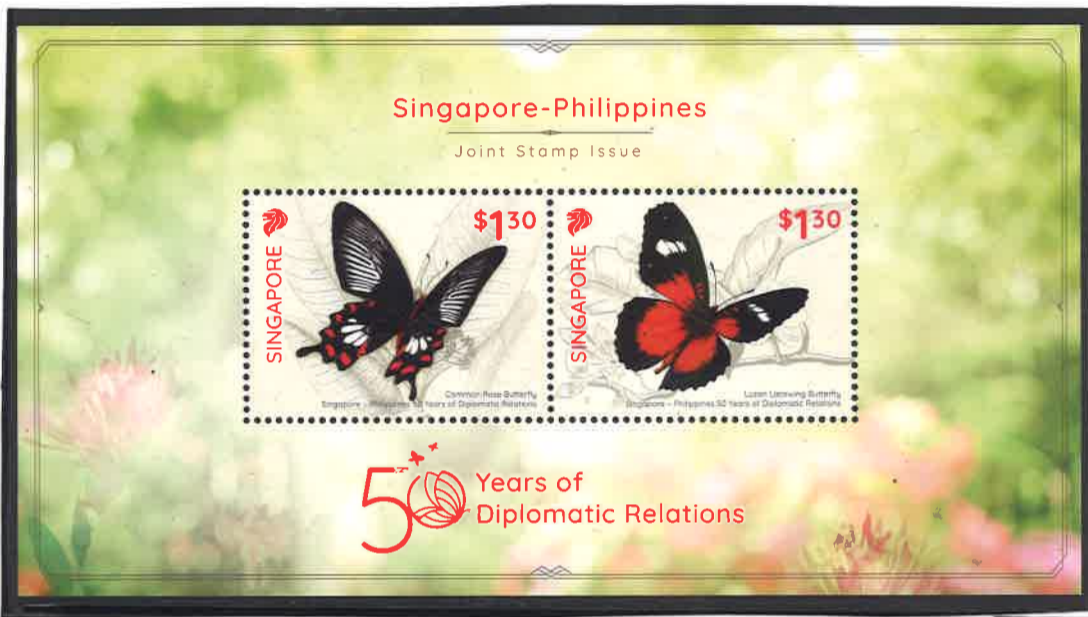
Singapore, 2019 Miniature sheet and two se-tenant stamps featuring Common Rose Butterfly, emblematic of Singapore and Luzon Lacewing Butterfly, representing Philippines Joint stamp issue celebrating 50 years of Diplomatic Relations between the two countries

Singapore and Philippines enjoy a close and warm relationship that has remained vibrant, and grown stronger over the years. To commemorate and celebrate the 50 th anniversary of diplomatic relations between the two countries a joint stamp issue was made in 2019, featuring butterflies of both countries. Symbolizing the two nations, the miniature sheets feature two butterflies, the Common rose, Pachliopta aristolochiae (Papilionidae), the national butterfly of Singapore, and Luzon lacewing, Cethosia luzonica (Nymphalidae), an endemic species in the Philippines.