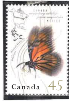
Canada, 1995 Monarch butterfly with migratory route and map