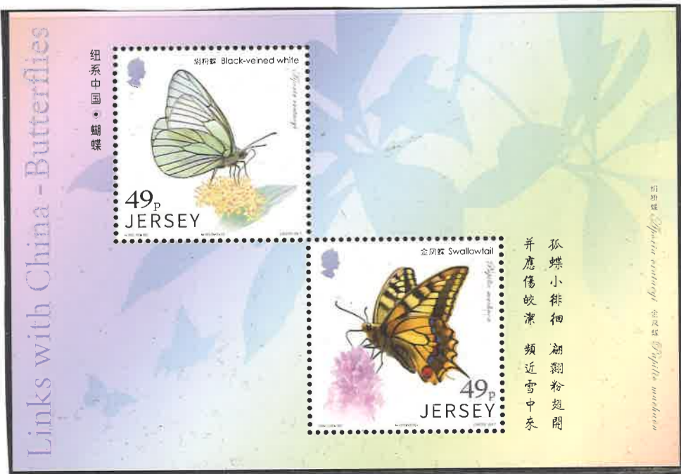
Jersey (UK), 2017 Miniature sheet and two se-tenant stamps featuring the two butterflies, Black-veined White and Common Yellow Swallowtail along with the Chinese common names for both species

China and Jersey have shared many exchanges between them to explore each other's cultures, natural resources and ways of life. To celebrate their natural links with China, Jersey issued stamps of two butterflies in 2017 that are found in both locations, each representing two ends of the faunal region called the Palearctic Region. The stamps feature the Black-veined White, Aporia crataegi (Pieridae) and the Common Yellow Swallowtail, Papilio machaon (Papilionidae).