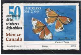
Mexico, 1994 Stylised Monarch butterfly

Monarch butterflies ( Danaus plexippus ) make an amazing 4000 km journey from eastern Canada to central Mexico in winter and return to Canada in spring. This phenomenal journey has formed a natural link uniting the two countries since before recorded history. Canada and Mexico share a vibrant, multi-faceted relationship characterized by deep people-to-people ties, and growing trade and investment, prompting both countries to very aptly feature the monarch butterfly on stamps to mark a half-century of diplomatic relations.