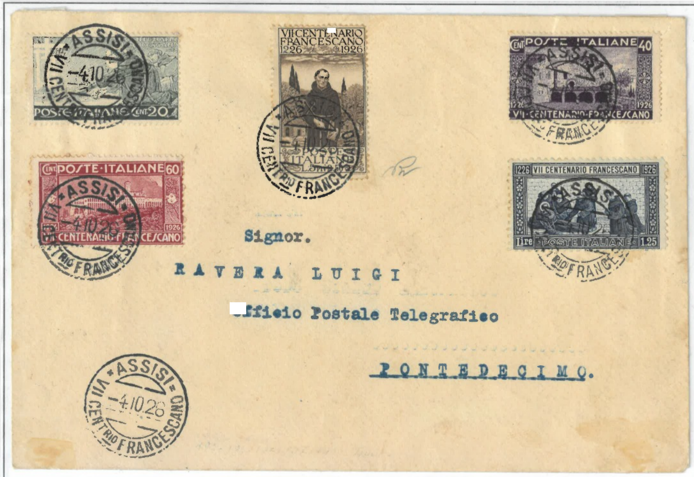
Letter from Assisi to Pontedecimo with cancellation of the centenary of the death of St. Francis 4/10/1926.