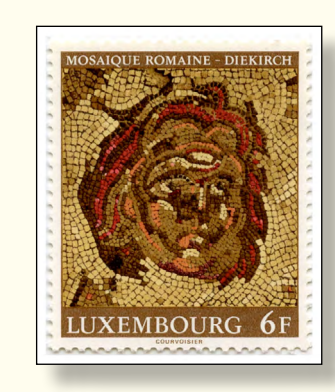
Medusa Mosaic - 1942