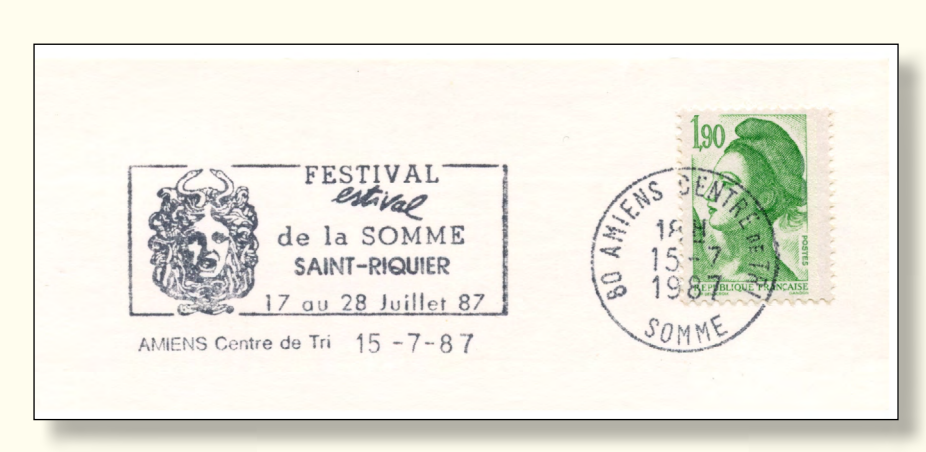
Head of Medusa in advertising slug of machine cancel - 1987

Greek heroes attempted to capture Medusa for her actions but she fled Athens. She hid in a secret and concealed cave on a desolate island to prevent turning more people to stone, sadly, without success.