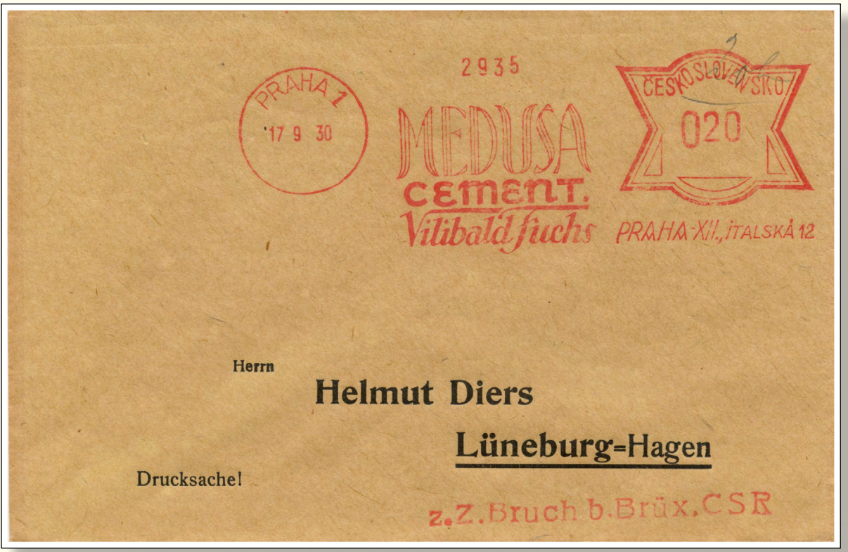
Postage meter with name Medusa in the advertising slug, domestic printed matter rate Prague to Lüneburg-Hagen, Czechoslovakia, 17 September 1930

Hyperlinks are embedded in images and text.