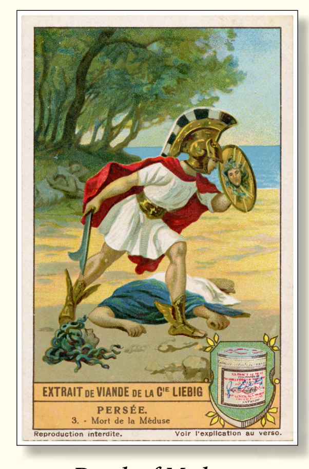
Death of Medusa Liebig Advertising Card - circa 1932

Looking only at Medusa's reclining figure in the mirrored shield's reflection, he cut off her head as she slept and slipped it into the sacred bag.