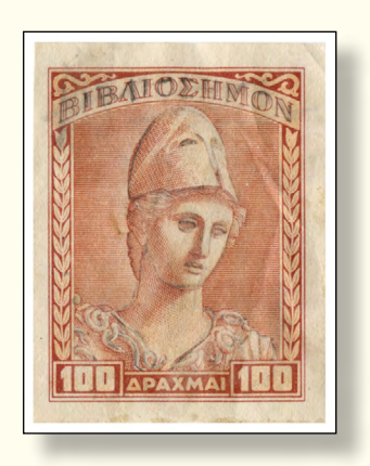
Athena School Book Revenue 1946