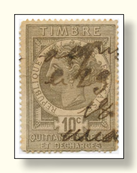
Medusa Revenue circa 1820