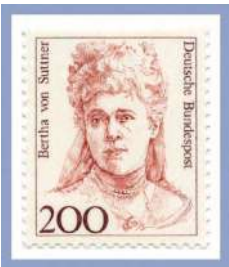
Bertha von Suttner