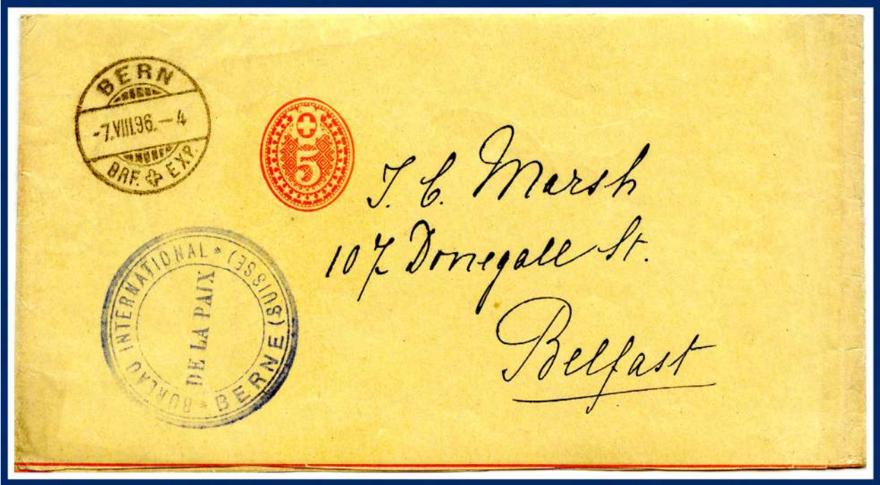
International Peace Bureau (IPB), Bern, Switzerland to Belfast, Ireland 2 August 1896, 5 centime rate wrapper Circular IPB origin cachet, Earliest recorded service cover from IPB

The ‘ International Peace Bureau ’, (IPB) founded in 1891, was one of the earliest efforts attempting to internationalize the many local and national peace organizations. It brought these organizations together in the form of an international federation. The organisation was awarded the Nobel Peace Prize in 1910 for acting “as a link between the peace societies of the various countries.”