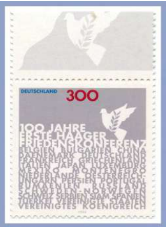
Centennial of the 1899 Hague Peace Conference

Many members also attended the 1899 and 1907 Peace Conferences in the Hague, Holland