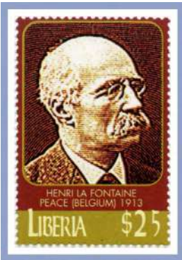
Henri la Fontaine

Henri la Fontaine (1854-1943) of Belgium served as president and Bertha von Suttner (1843-1914) of Austria as honorary vice-president.