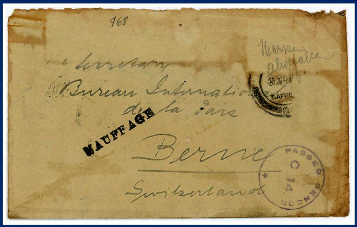
South Africa to the International Peace Bureau, Berne, Switzerland 26 April 1918, circular censor C14 via S.S. Kenilworth Castle which collided with British destroyer H.M.S. Rival on 4 June; The accident set off the Rival's depth charges which damaged both ships (Incident)

The Swiss IPB acted as an intermediary, forwarding mail between war victims or prisoners and families.