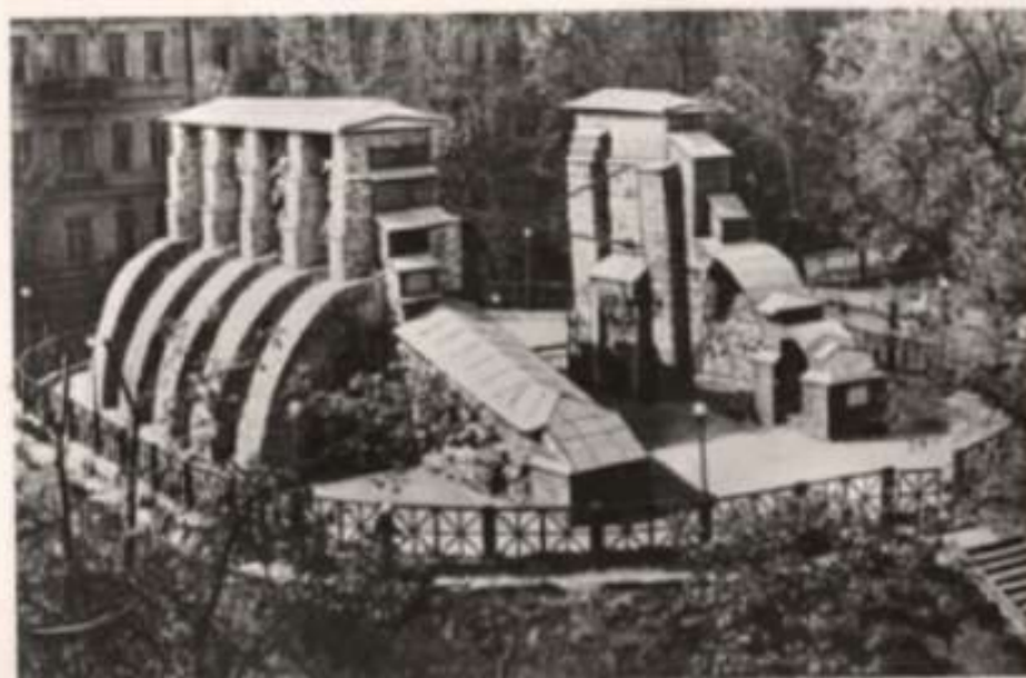
Ruins of the Great Gate (postcard ca 1930)

The city now known as Kyiv, capital of Ukraine, traces its history as early as the 9 th century CE. In the 11 th century it was fortified by a wall with gates. The Southern Gate became known as the Golden Gate, reportedly modeled after that gate in Constantinople. It later became known as the Great Gate of Kyiv. The gate was partly destroyed in 1240 and in later centuries became little more than a ruin. In 1982, during the Soviet era, the gate was rebuilt, but historical accuracy is uncertain.