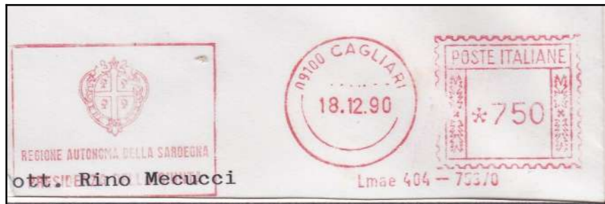
Automatic franking used on 18 December 1990 in Cagliari by the Autonomous Region of Sardinia

Cagliari is the capital of one of the regions into which Italy is divided, the Autonomous Region of Sardinia . On this page, I describe some of the beauties of the city and some important details of its past and present history.