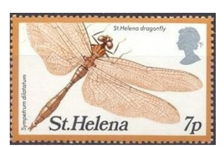
Dragonfly Sympetrum dilatatum