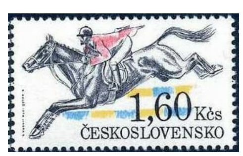
'Grand Pardubice' a notoriously dangerous race