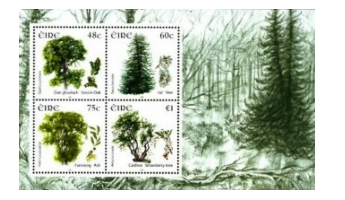
British trees in danger