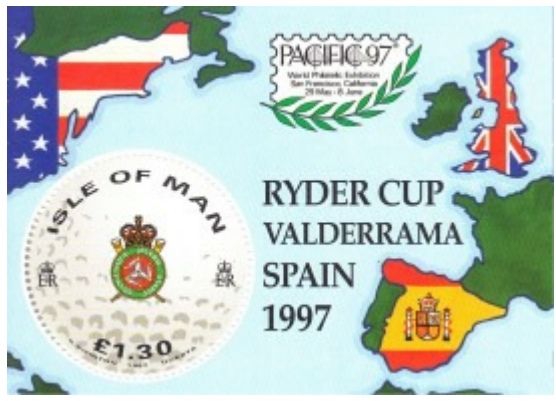
Game of golf