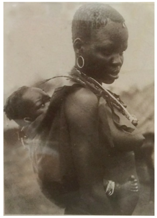
People on Anglo-Egyptian Sudan