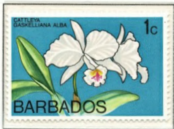
Perf 14.5 x 14

All plants and animals must initially be named and described according to a set of criteria and then published in a 'recognized' authoritative publication. Usually a botanist undertakes the description often naming plants, including cattleya, after orchid enthusiasts or gardeners. It is a requirement that all names are latinized.