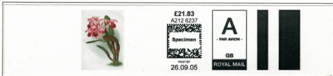
Specimen Meter mark Cattleya lawrenceana