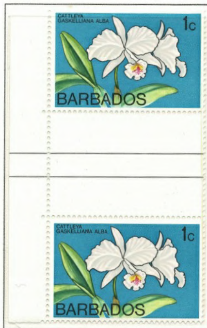
Horizontal gutter pair. Watermarked Perf 14 x 14

Named by the famous orchid nurseryman Frederick Sander in honour of Holbrook Gaskell of Liverpool, a wealthy industrialist and early orchid connoisseur.