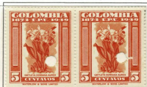
Ex Waterlow file with security hole. Issued 22 Aug 1950.