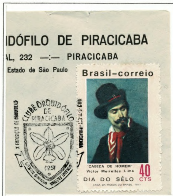
Special cancel Cattleya lueddemania

Indica Cattleya aclandiae logo for the Orchid Species Society Inc.