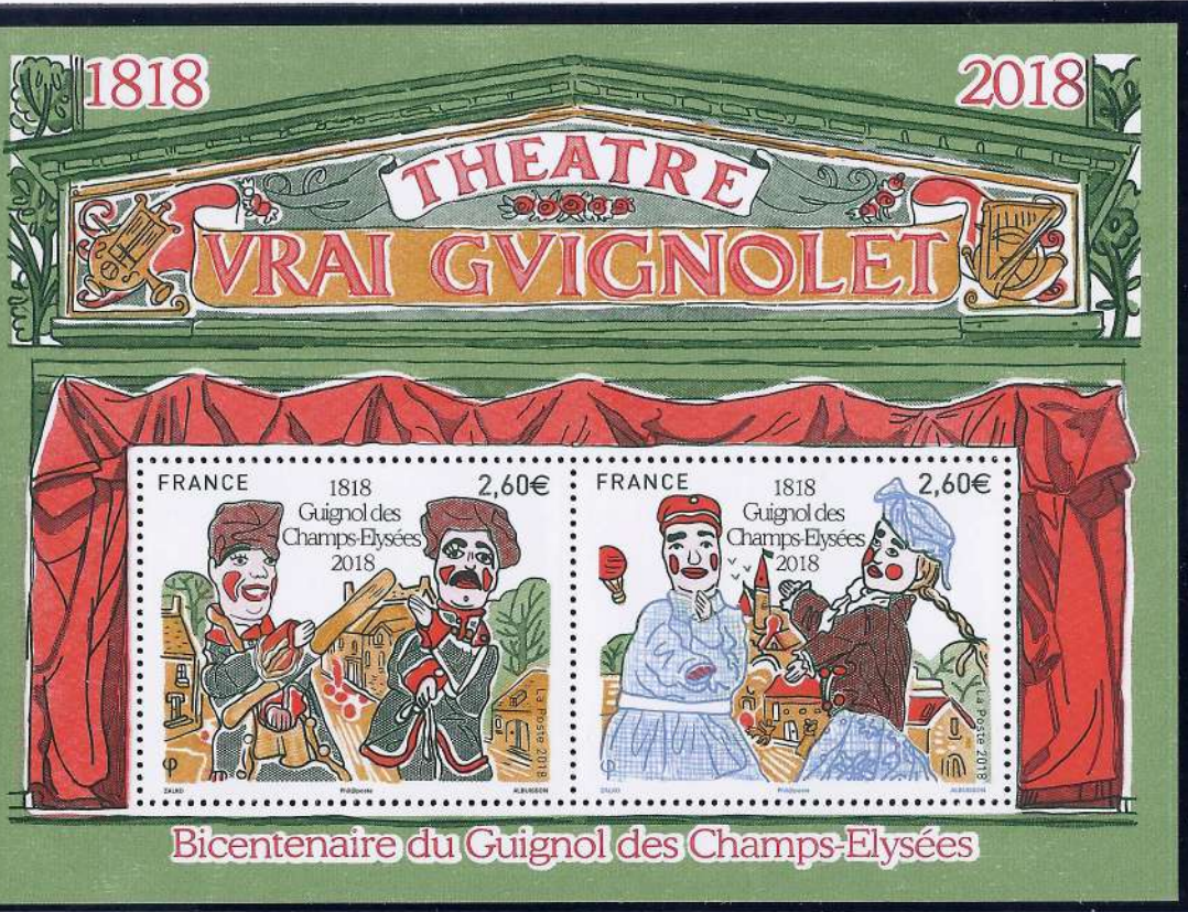
Bicentenaire du Guignol des Champs-Élysées

Throughout France, small theaters are emerging, particularly in Paris.