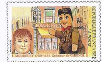
FRANCE 20 g

Envelope (postal stationery) issue of 1994