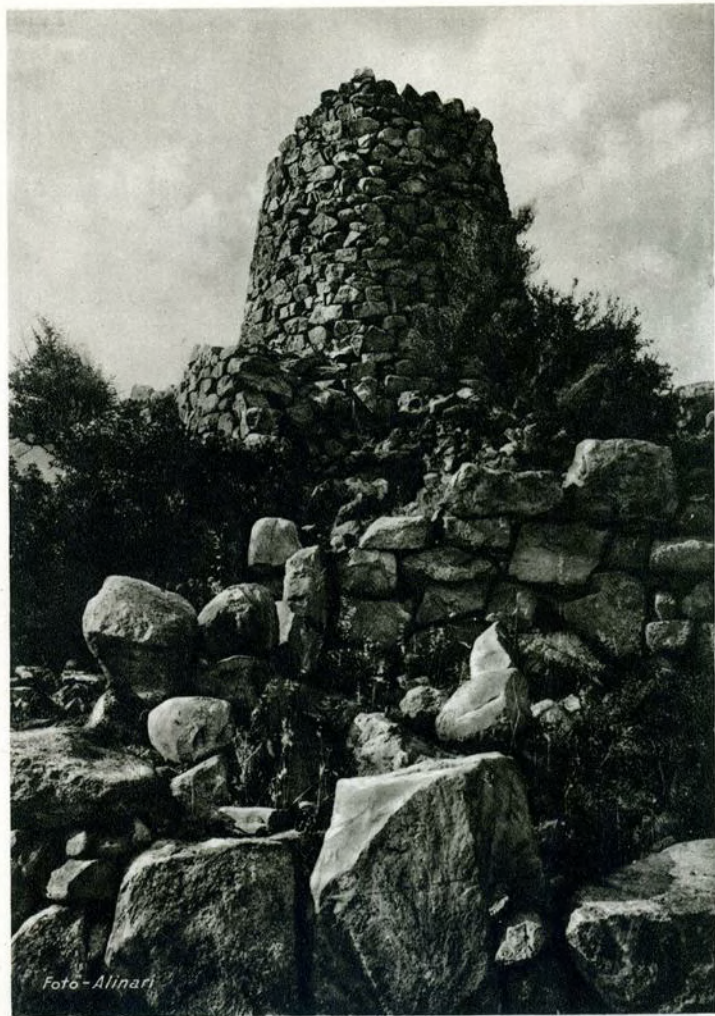
CAGLIARI - Strada da Cagliari a Muravera - Nuraghe Soro.