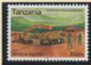
The Mawdui Mine