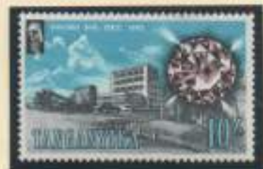
Correct colour, the Pink Diamond