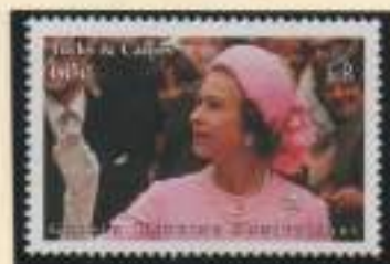
The Queen wearing the Williamson Pink Diamond Brooch