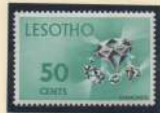
'Brilliant' cut white Diamond

The stone was cut by a craftsman into a 23.6 round brilliant cut stone. It was placed into a Platinum and white Diamond setting as the centre of a Jonquil flower, forming a brooch worn by the Queen to this day.